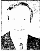
Skinner Arnall Golden Gregory LLP

The visit is part of an initiative, begun about a year and a half ago, designed to educate Israeli investors, lawyers and brokers about U.S. real estate opportunities, and thus increase business for the Atlanta law firm.