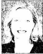
Rabinovitch Arnall Golden Gregory LLP